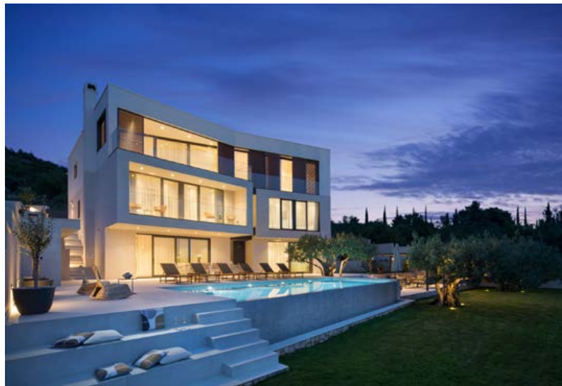
VILLA Ó • ORAŠAC / DUBROVNIK