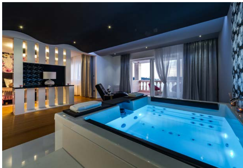
VILLA ROSARY • LOZICA / DUBROVNIK