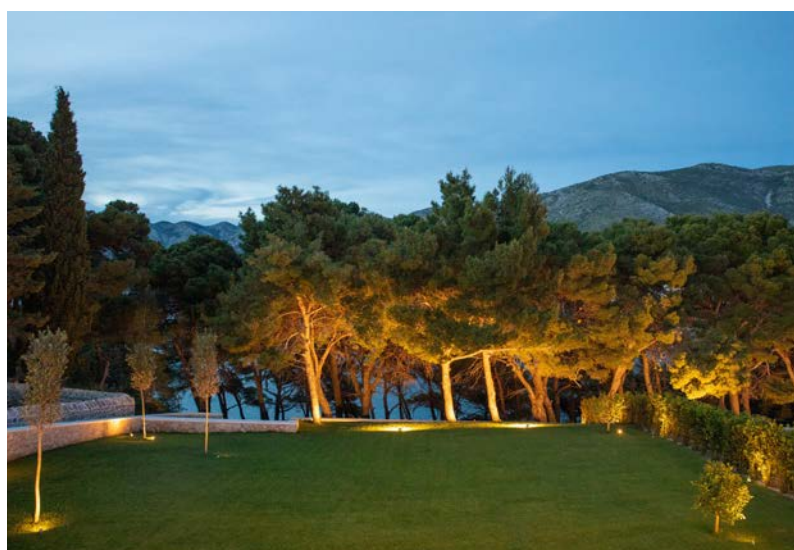
VILLA RAT • CAVTAT / DUBROVNIK