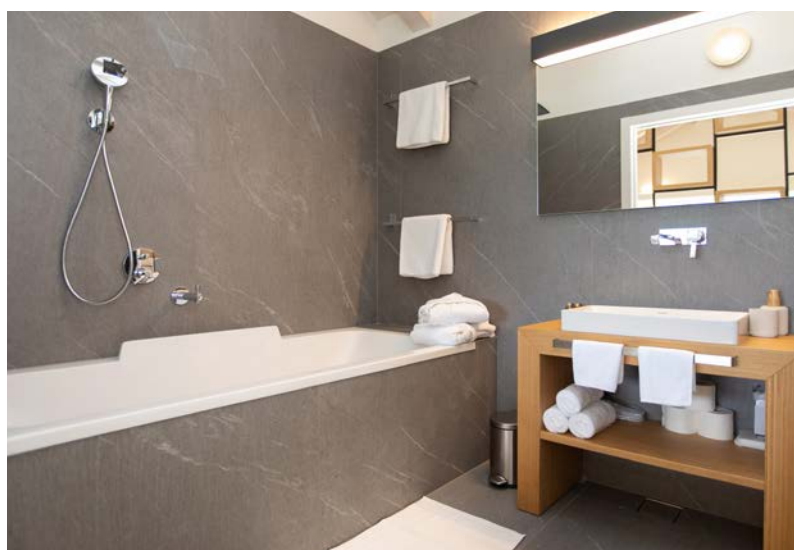
VILLA RAT • CAVTAT / DUBROVNIK