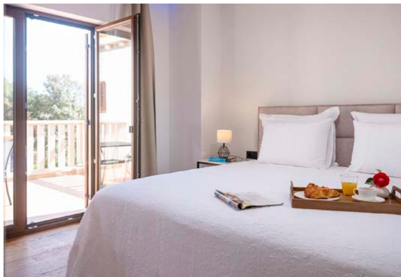
VILLA PELEO • CILIPi / DUBROVNIK