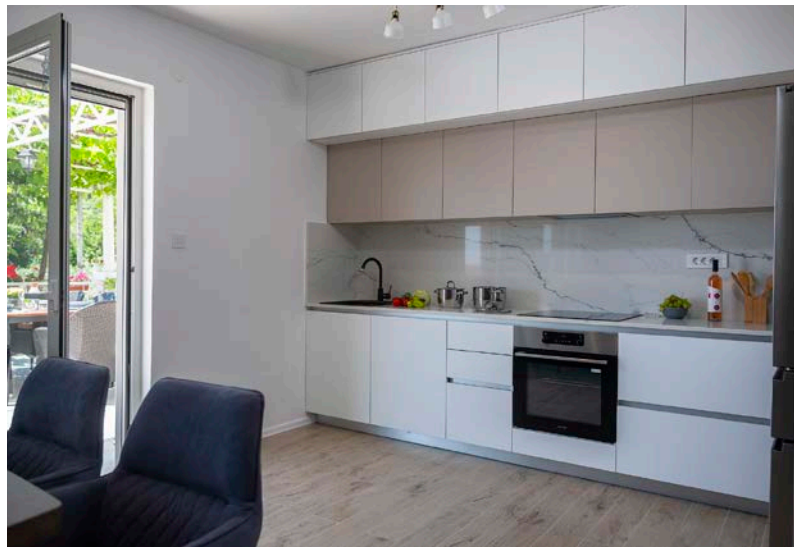
VILLA OLIVIA • ZATON