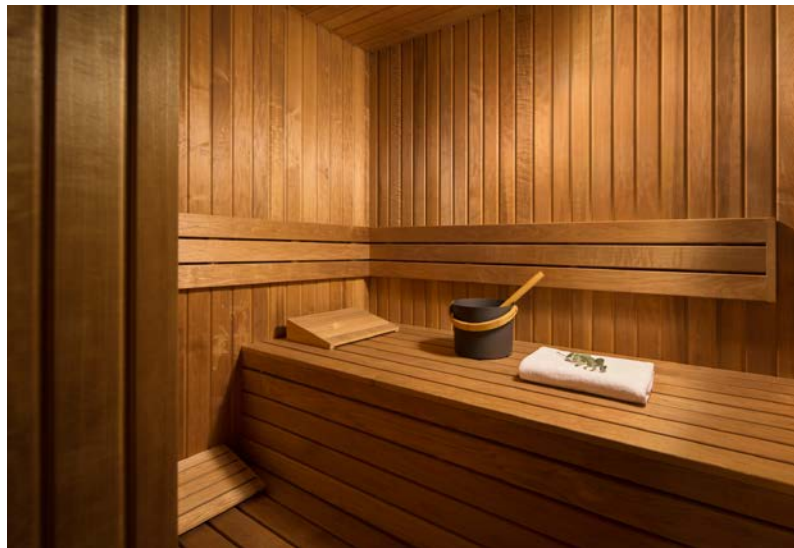
ANTOAN'S VILLA • ZATON / DUBROVNIK