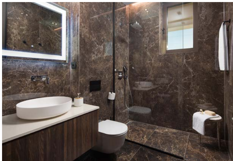
ANTOAN'S VILLA • ZATON / DUBROVNIK